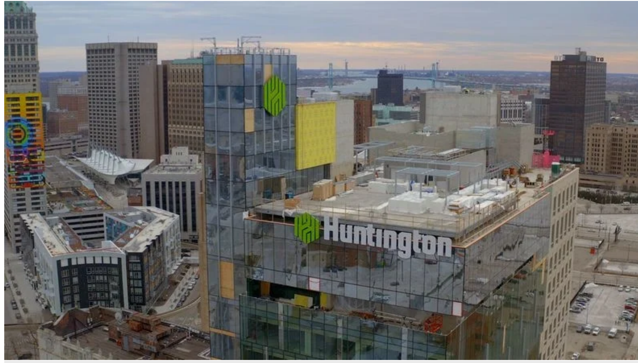
Huntington Bank, which is set to move into its new building in downtown Detroit later this summer, reported a record quarterly profit.

While some top bank executives are warning of a pending "economic hurricane," many financial professionals are touting relatively calm seas this earnings season.